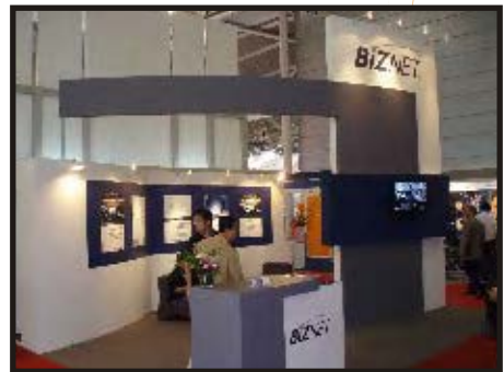
Biznet Join Event Communicasia 2008 Singapore Expo