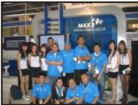
Biznet Join Event Indonesian Computer Festival 2008 - Jakarta Convention Centre